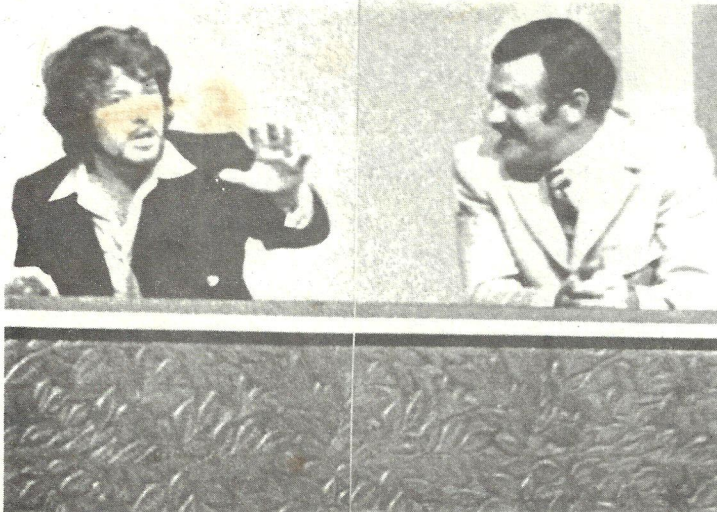
Mod Squad stars Michael Cole and Tige Andrews talk to city high school journalists at ABC's Press Corps meeting Thesday. Meetings are held monthly and are designed to give young writers news conference experience.

Cole, who portrays Pete Cochran on the weekly TV series, has also been doing some movie work in the past month added that "many times the taxes on a movie will be so enormous that it's rough for many companies to make a profit". He added that he considers himself "very lucky" to be working with all the problems that have been encountered by today's movie industry.